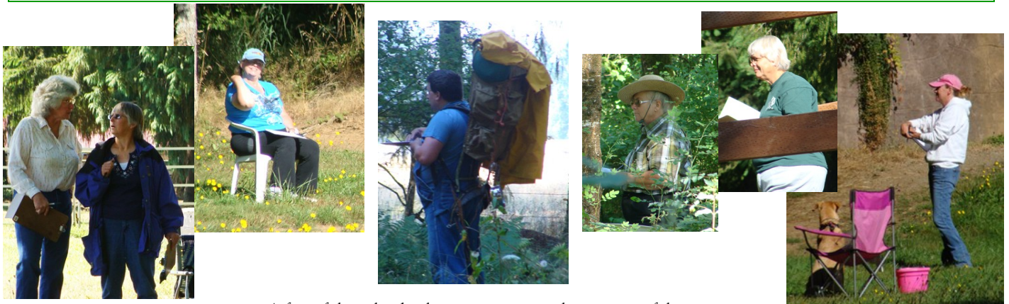
A few of the valued volunteers so essential to a successful event

Shown here working at the Happ's Trial Horse challenge September 3rd.